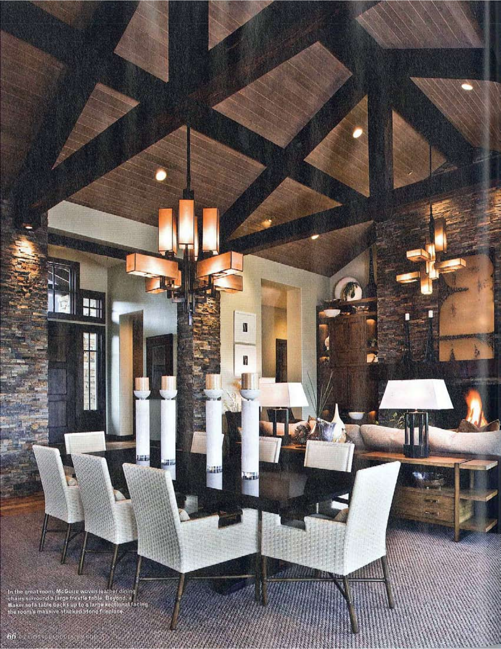
In the great room, McGuire woven leather dining chairs surround a large trestle table. Beyond, a Baker sofa backs up to a large sectional facing the room's massive stacked stone fireplace.