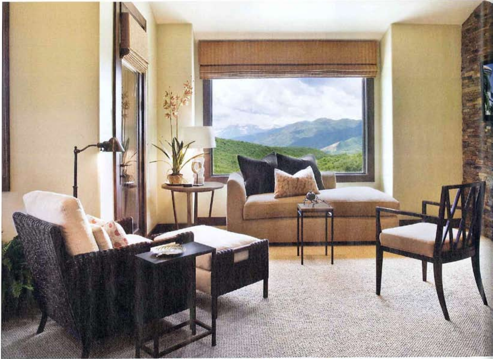
A mix of dark and mid-tones creates dimension in the master bedroom's sitting area. A Thomas Pheasant woven chair and ottoman featuring a dark tobacco finish contrasts with a light-toned Kreiss chaise and rifted oak round table by Baker.